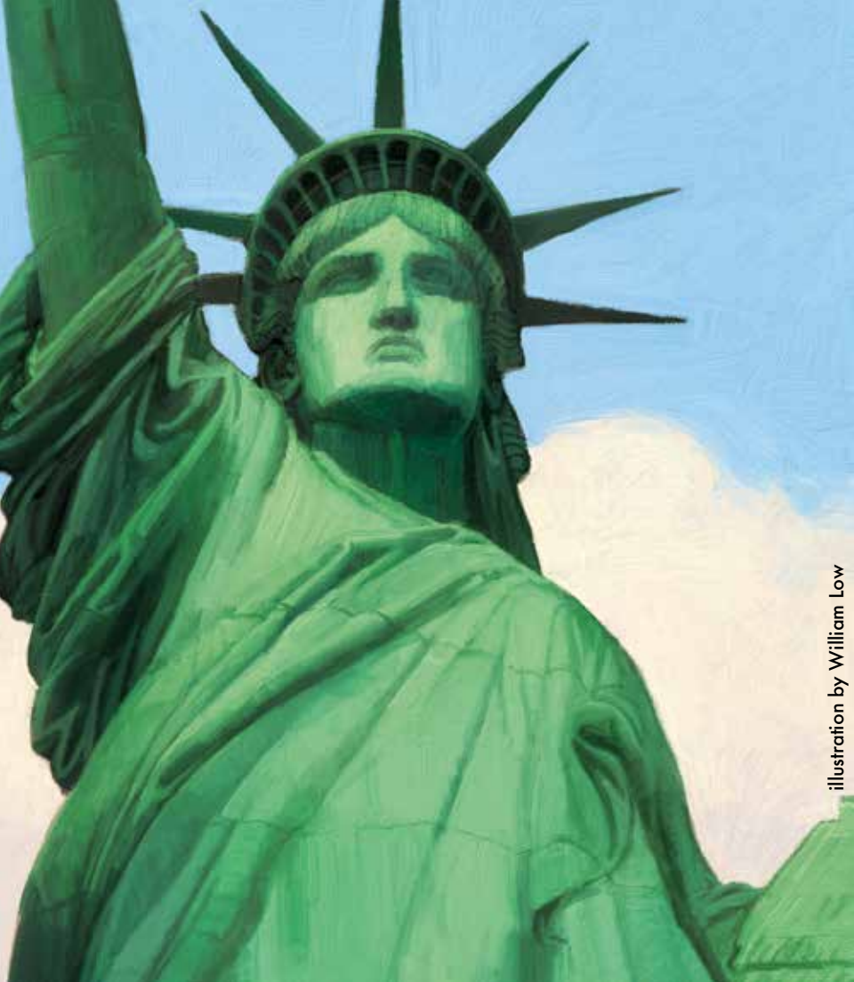
illustration by William Low